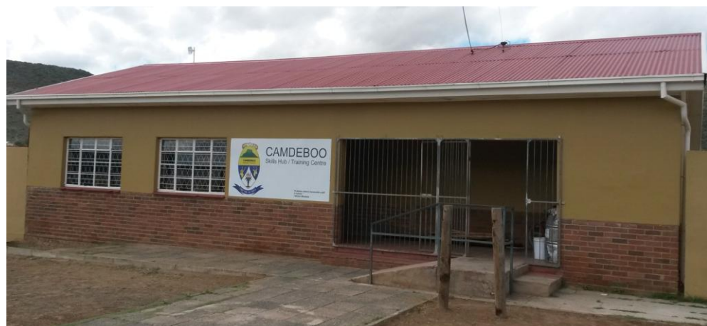
Figure 4 Existing building suited as Multipurpose Community Centre