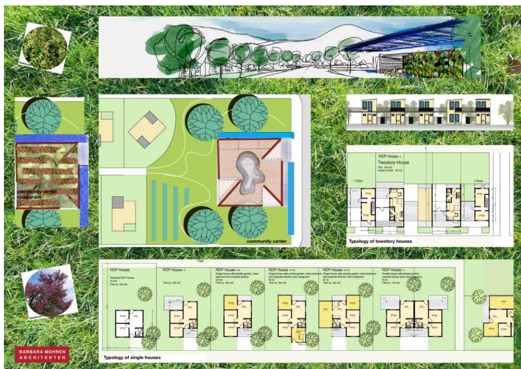
Figure 2 Design examples for the dwellings, as presented at Kick-off

Presentations, collected on a memory stick, and printouts of first design proposals of RDP and RDP+ houses prepared by Mohren Architects, were handed over to CLM.