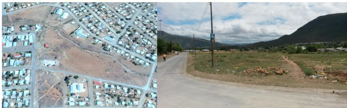
Figure 3 Project site position in Kroonvale Settlement